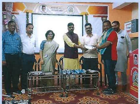
Alumni Meet Organised by college on 5 th May 2023

Smdh Principal Swa.Sawarkar Mahavidyalaya, Beed.