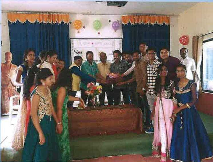
Portable Vacuum Cleaner Machine Gifted by alumni of Commerce Faculty