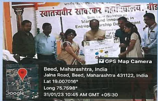
One day Workshop On 'Startup and Innovation in Entrepreneurship Development' Organised by Alumni Association held on 31/01/2023